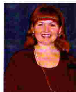
Paula Jones Instructional Development Center